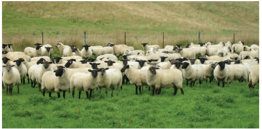
Suffolk Ram Lambs mid February 2011

Over the last four years in our commercial flock we have increased the meat yields (based on viascan results) in our Terminal cross lambs from 53.35% lean meat to 55.06% and in our Romney lambs from 51.60% lean meat to 53.54%. So the 6 years of MyoMAX blood testing and using MyoMAX rams is showing good results.