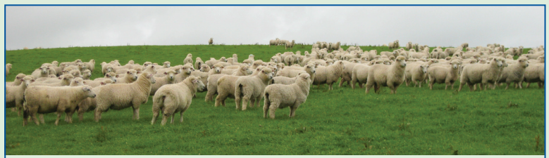
Romney Ram Lambs mid February 2011 – Undrenched (and Unculled)