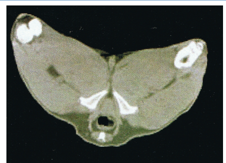
CT slice through the hind legs on a Nithdale Double copy MyoMAX Suffolk ram lamb

This year we CT scanned a lot more ram lambs – both Suffolks (32) & Romneys (62) in order to get better information on meat yield. The meat index on our reports include this information making it more accurate. It gives better recognition to MyoMAX carriers with double copy Suffolks averaging $1.61 better in Meat Index than non carriers and double copy Romneys averaging $0.65 better in Meat Index than non carriers. Each year we continue to CT scan we should make faster progress in improving overall meat yields in our sheep which will result in better meat yields for our commercial clients.